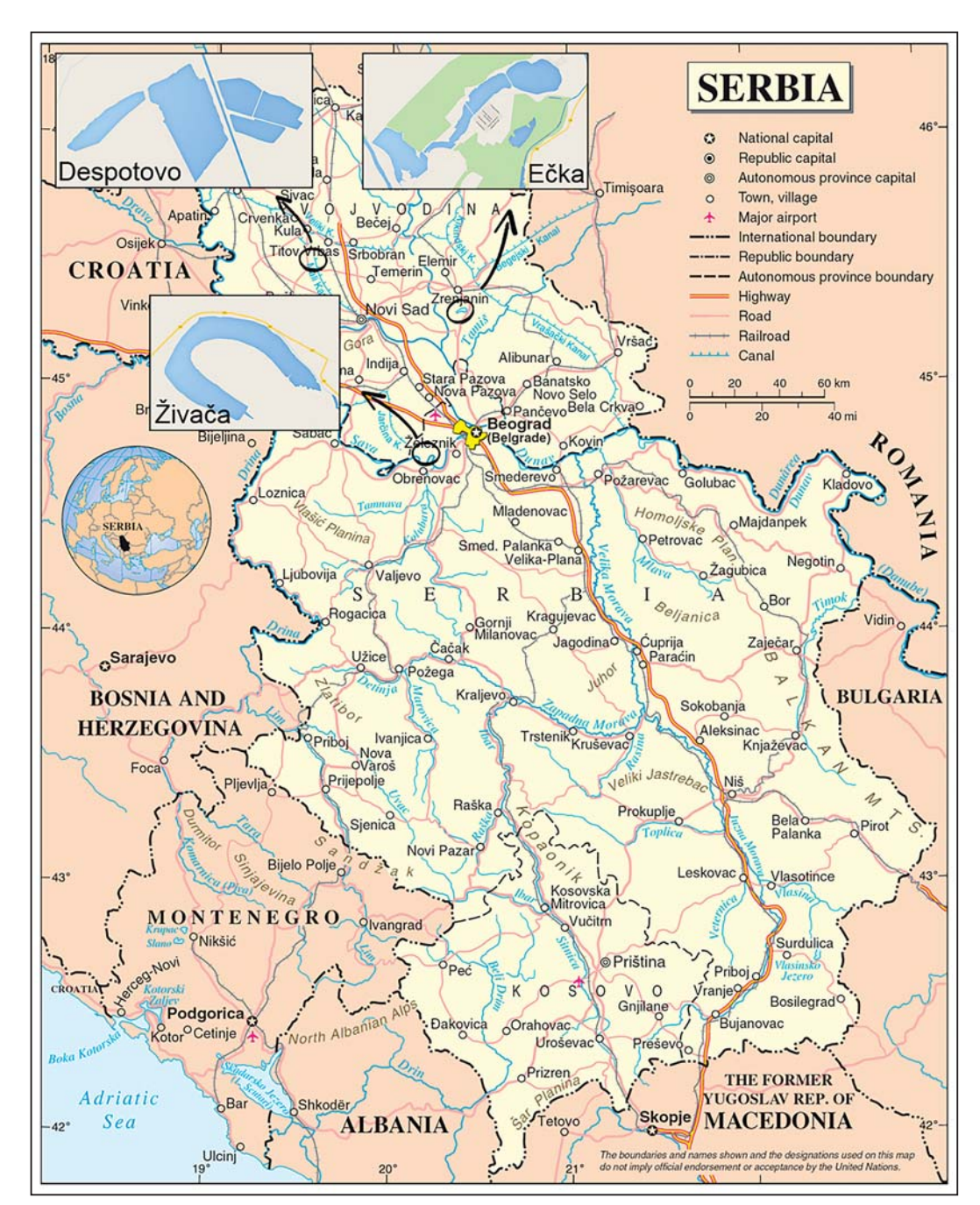
Figure. 1 The geographical positions (GPS data) of the fish farms. (Zivaca: Carp supplementary fed maize) latitude 44.73, longitude 20.18; Ecka: (Carp supplementary fed extruded feed) latitude 45.24, longitude 20.36; Despotovo: (Carp supplementary fed pelleted feed) latitude 45.45, longitude 19.54)

For the study, two and a half years old market-sized carp (n=8) were obtained in October 2015 from three commercial carp farms from batches of fish harvested for the market. The fish farms were